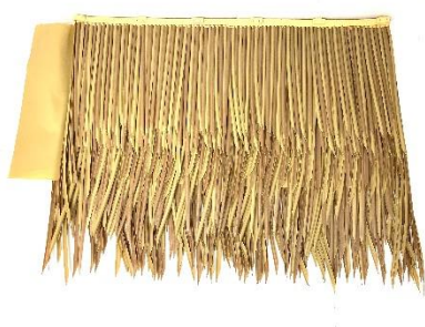
Viro Corner Tile – With Membrane