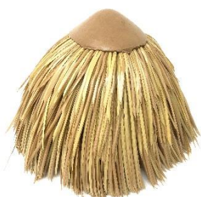
Viro Ridged Top Piece