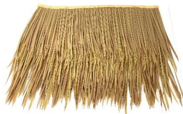
Viro Thatch Tile