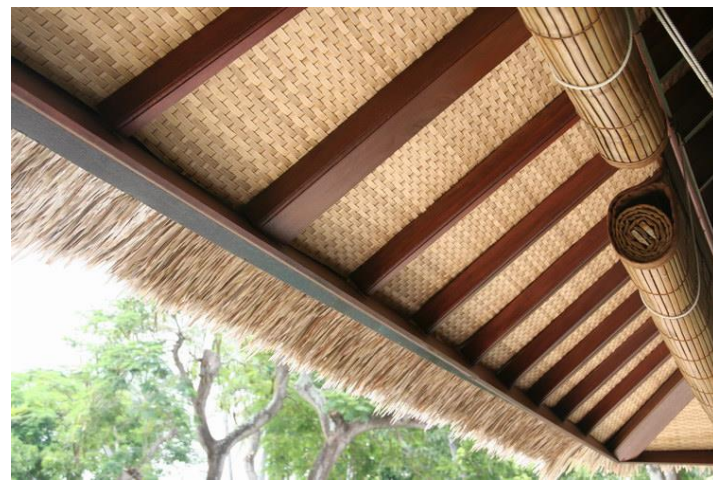
Staples or Nail