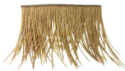
Viro Thatch Sub-